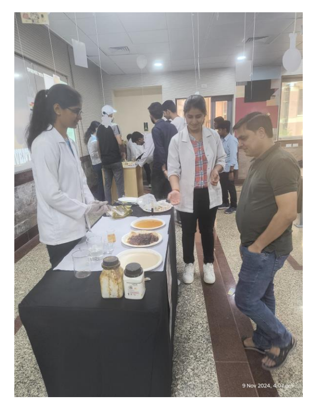
No of Participants- 129